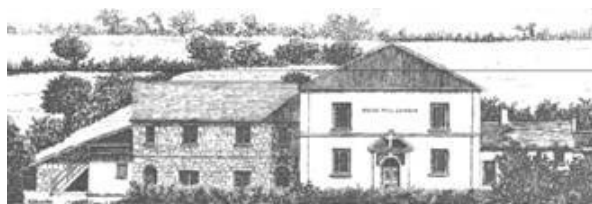
HICKS MILL METHODIST CHURCH