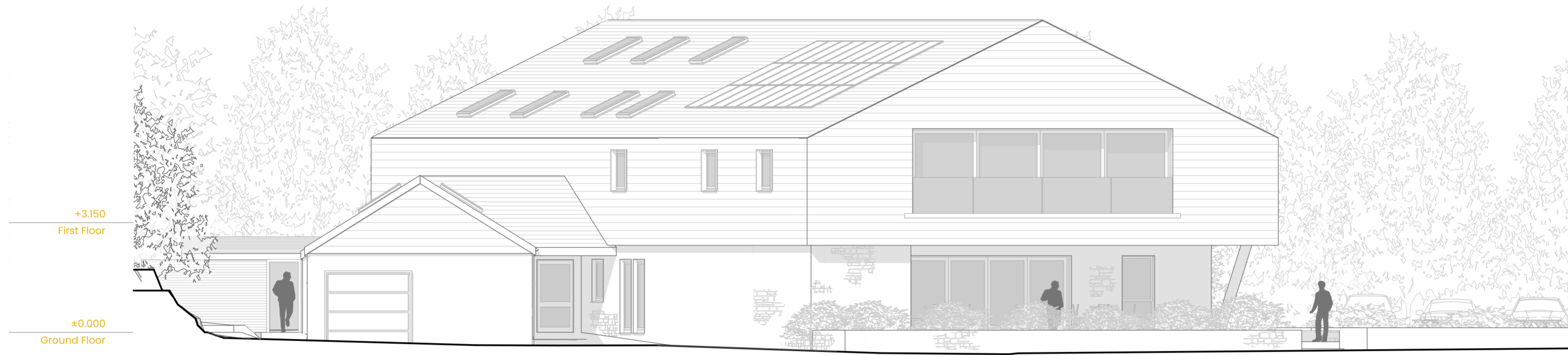
East Elevation | E-03

This drawing is copyright to marraum. Do not scale, for construction purposes. All dimensions are to be checked on site and any discrepancy, error or omission is to be reported to the architect. This drawing shall be read in conjunction with all relevant architect's and engineer's drawings and specifications.