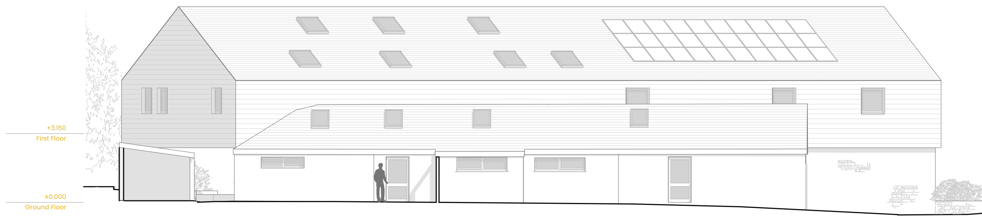
South Elevation | E-04